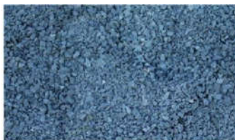
Fig .2 Fine Aggregate

The other sort of mixtures are those particles passing the 9.5 metric linear unit (3/8 in.) sieve, nearly entirely passing the 4.75 mm (No. 4) sieve, associate degree preponderantly preserved on the seventy five \mu\text{m} (No. 200) sieve are known as fine aggregate. For enlarged workability and for economy as mirrored by use of less cement, the fine aggregate ought to have a rounded shape. the aim of the fine aggregate is to fill the voids within the coarse aggregate and to act as a workability agent In concrete, an mixture is hired for its economic system factor, to reduce any cracks and most importantly to deliver energy to the structure. they're shown in fig.2