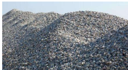
Fig.1 Coarse Aggregate

Coarse-grained mixtures won't tolerate a sieve with 4seventy five metric linear unit openings..Those particles that are preponderantly preserved on the 4.75 mm sieve and can pass through 3-inch screen, are referred to as coarse aggregate. The coarser the aggregate, the additional economical the mix. Larger items provide less area of the particles than identical volume of tiny pieces. Use of the biggest permissible maximum size of coarse aggregate permits a discount in cement and water requirements. exploitation aggregates larger than the utmost size of coarse aggregates permissible may end up in interlock and type arches or obstructions inside a concrete form. that enables the world below to become a void, or at best, to become crammed with finer particles of sand and cement solely and results during a weakened area. they're shown in fig.1 For Coarse Aggregates in Roads following properties are desirable Strength