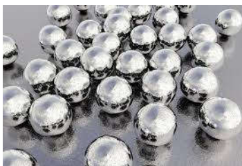
Fig 5 : Silver Nanoparticles

The researchers located that silver nanoparticles had a damaging end result on cells, suppressing cell increase and multiplication and causing necrobiosis relying on concentrations and duration of exposure. In particular, the two hundred nm silver debris brought on a concentration-structured boom in DNA harm within side the human cells.