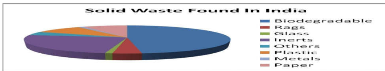
Figure 1: Pie Chart Showing Municipal Solid Waste in India

According to various Municipal Waste Management, Plastic materials comes under solid waste with their state. So by our solid waste management the solid waste dump in an open area but where it is not decomposes.