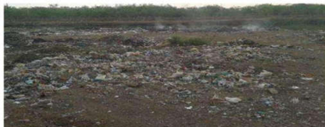
Figure 3: Plastic Burning in open dumping

Industrial Plastic waste was recycling method but it does not reduce it in large amount in India.