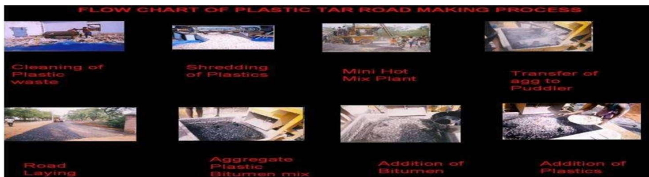
Figure 5: industrial waste Plastic Tar making process

We can see the process by looking at the figure 5: