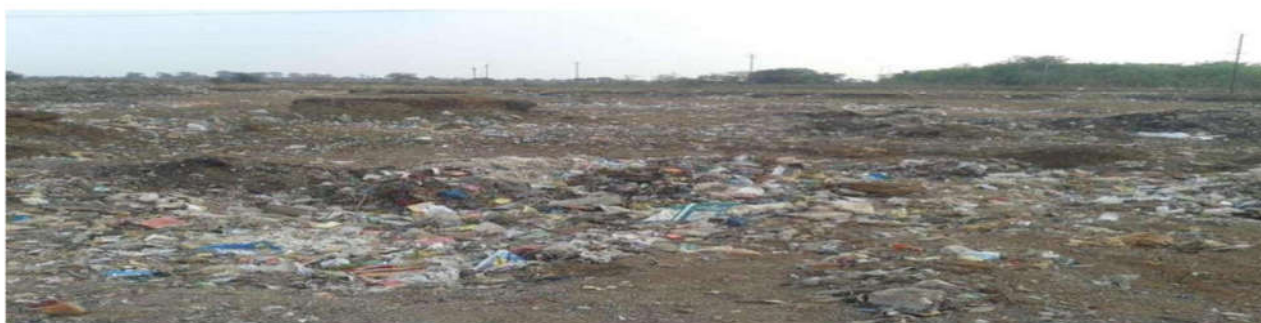
Figure 2: Waste Plastic Open Dumping

The littered plastics, a non biodegradable material, get mixed with domestic waste and make the disposal of municipal solid waste which is very difficult.