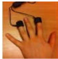
Fig. 3 GSR electrodes attached to fingers