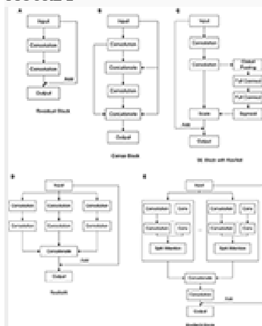
Figure 2. Structures of different convolutional neural network (CNN) models tested. (A) Residual Block, (B) Dense Block, (C) SE Block with ResNet, (D) ResNeXt, (E) ResNeSt Block.