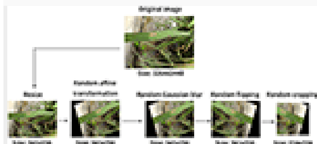
Figure 1.Steps of the image preprocessing for expanding dataset and reducing the overfitting of models.

Then, the mean and standard deviation of the ImageNet dataset were applied for standardization to make picture shading dispersion as comparable as could really be expected. As the quantity of pictures of various sorts of illnesses was not equivalent, an over-testing activity was taken on for few rice earthy colored spot pictures in the preprocessing, with a proportion of multiple times. This interaction was rehashed for each preparing age; consequently, the quantity of pictures that each model read was different in each preparing age, and the quantity of picture tests in the dataset was expanded thusly.